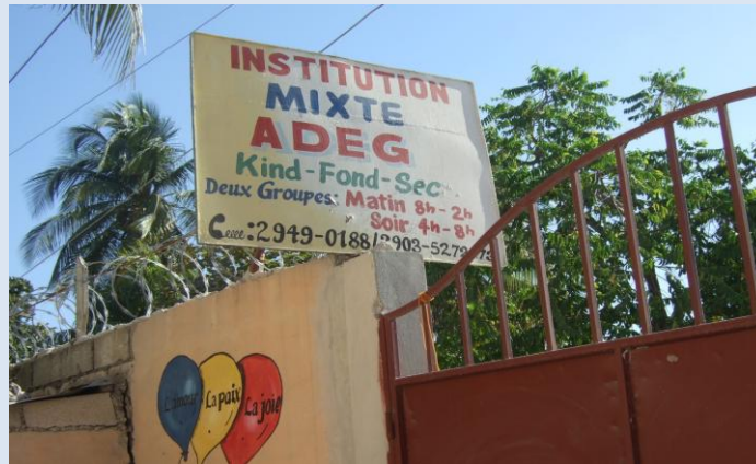
One of the schools benefitting from the tuition subsidies - EFA