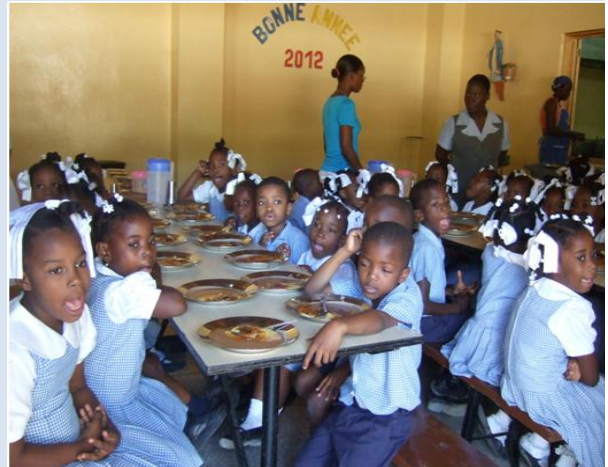
Children at L'École Jn Paul II, Fleuriot, enjoying a meal of rice, stewed red beans and herring