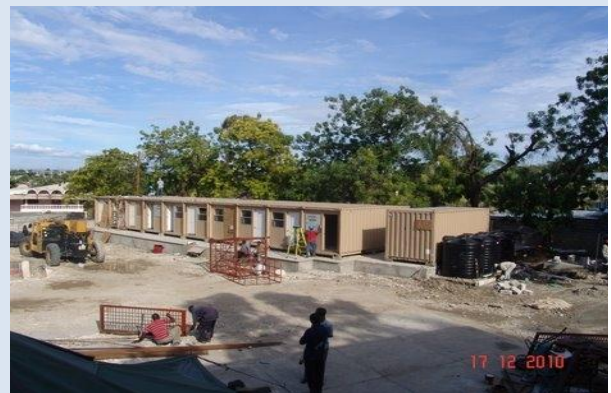
New Temporary Offices under construction for GOH agencies within the Ministry of Public Works, Transport and Communications