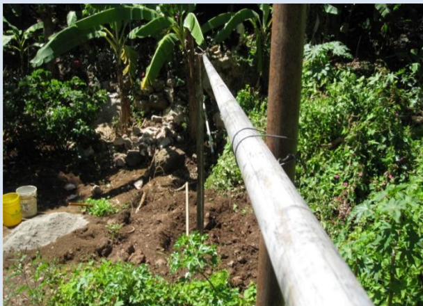
Small Scale Irrigation project