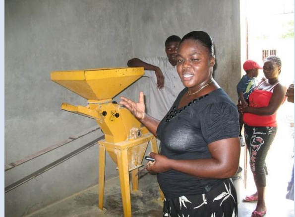
Women's Group Corn Milling Project