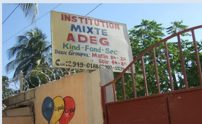
One of the schools benefitting from the tuition subsidies - EFA