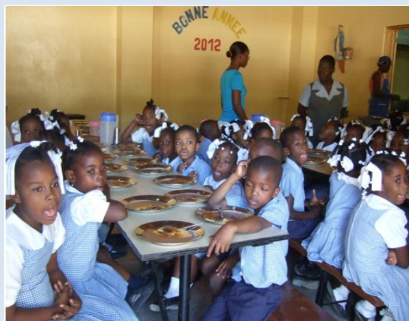
Children at L'École Jn Paul II, Fleuriot, enjoying a meal of rice, stewed red beans and herring