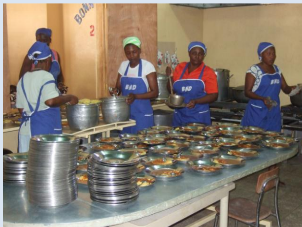
Workers in school feeding programme at L'École Jn Paul II, Fleuriot - EFA