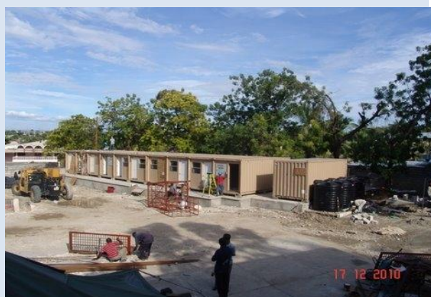
New Temporary Offices under construction for GOH agencies within the Ministry of Public Works, Transport and Communications