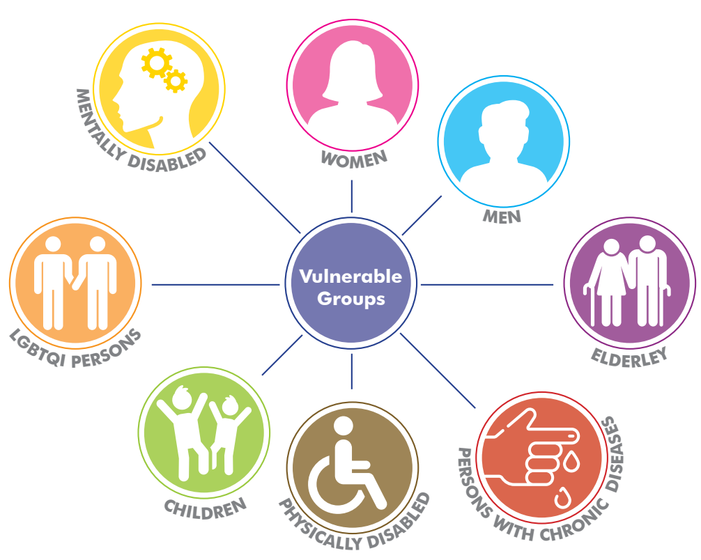
Figure 1: Most Vulnerable Groups during Disasters

Gender in DRR extends beyond the relationship between women and men but includes sub-groups and intersects of different vulnerable groups. As it relates to climate change and disasters, such vulnerable and disadvantaged groups include: women and girls who are at risk because of gender practices, the elderly, those with certain diseases or disabilities, children and young people in difficulty such as orphans, displaced persons, people of a particular sexual orientation, and members of minority groups. See diagram below: