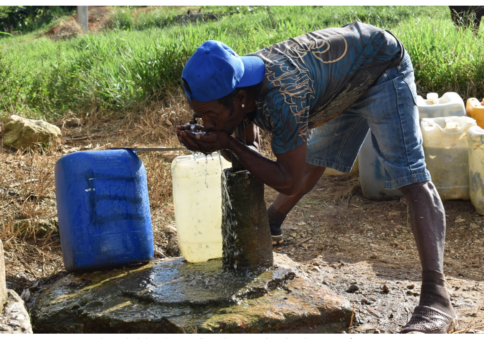
Access to water increasingly is an issue as climate impacts such as drought get more frequent.

in their intensity and frequency, the Caribbean faces greater challenges to recover from the impacts.