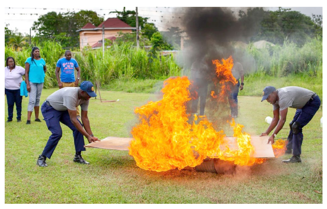
Based on gender roles, men would be the ones expected to undertake more risky tasks such as putting out fires.