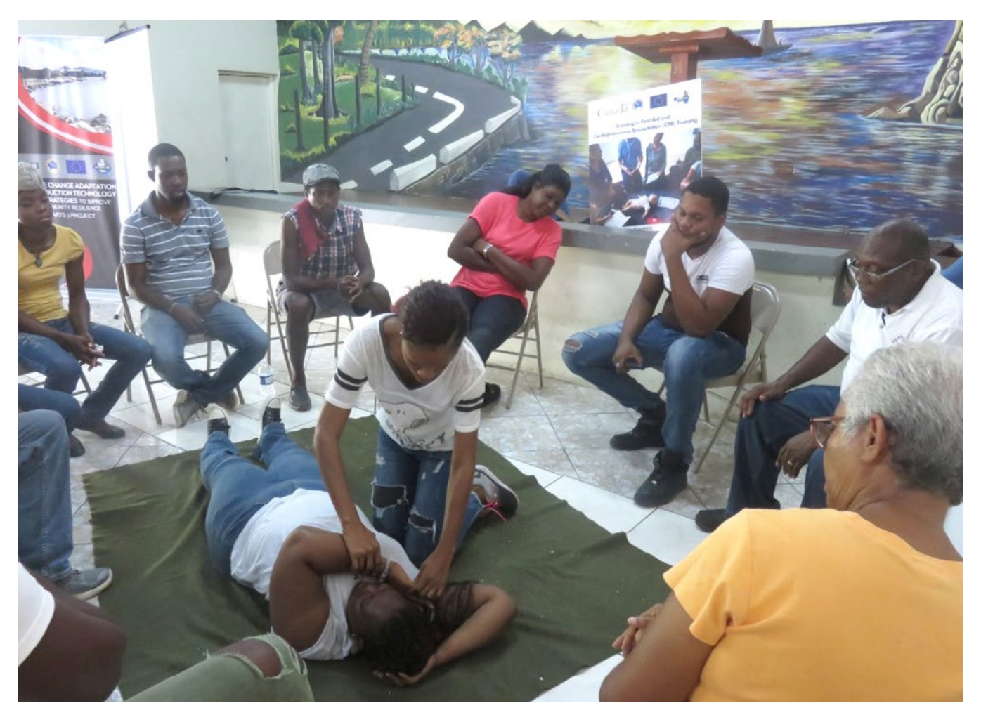
It is important that both men and women understand basic first aid and that both genders can provide help in a disaster disaster.