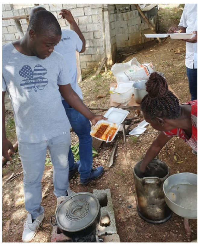
When society ascribes gender roles women are usually expected to do domestic duties such as cooking.

All vulnerability groups in disaster-affected communities should actively participate in the design and location of new housing and communal infrastructure, such as water and sanitation facilities, as well as the repair of existing structures. This is to ensure that the community needs are considered and that the restoration activity does not lead to unsafe living conditions. The hiring of both men and women for construction and repair of houses is strongly