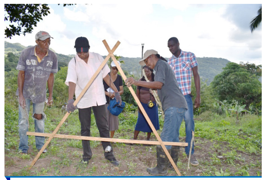
Farmers in upper Clarendon learn to use the A-Frame.

developed Community Adaptation Plans (CAPs) for their communities. Plans also included Disaster Risk Reduction (DRR) activities and hazard maps.