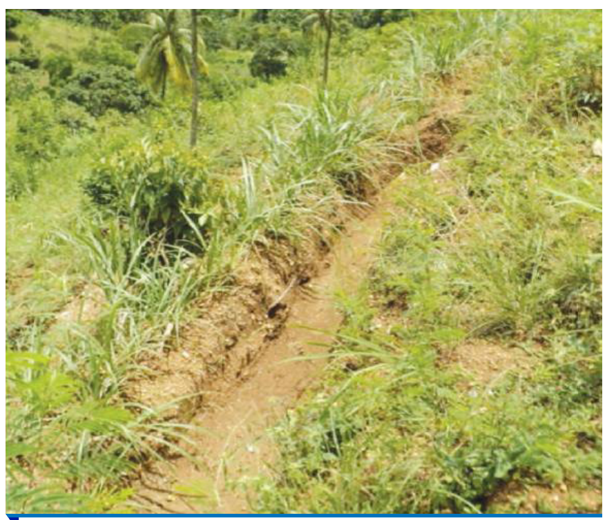
Diversion ditch - one of the methods used by farmers to reduce flooding risk.

It is also important to encourage partnerships between community members and key organisations. This will ensure that follow-up trainings and opportunities can be maximised by the community actors as needed to ensure longevity of project training and knowledge.